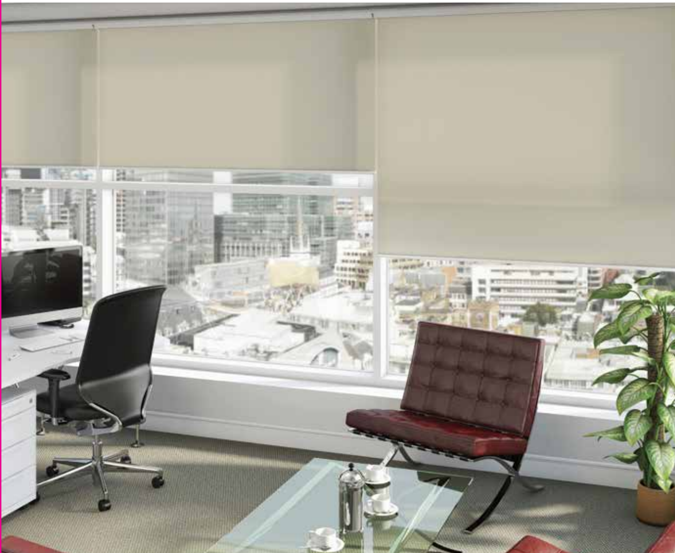
DIM OUT SPC